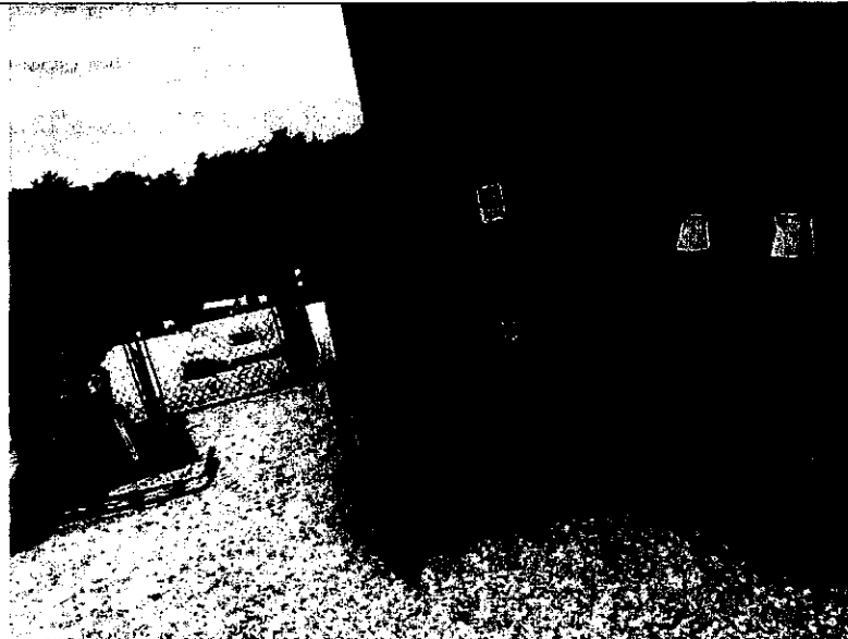
65 Hornblower Drive, A/C unit, 08/07/15

If submitting more photographs than will fit on the preceding page, affix the additional photographs below. Identify all photographs with: date taken; "Front View" and "Rear View"; and, if required, "Right Side View" and "Left Side View." When applicable, photographs must show the foundation with representative examples of the flood openings or vents, as indicated in Section A8.