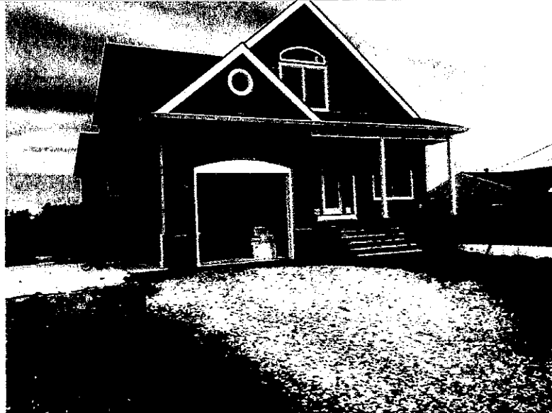
65 Hornblower Drive, Front, 08/07/15

If using the Elevation Certificate to obtain NFIP flood insurance, affix at least 2 building photographs below according to the instructions for Item A6. Identify all photographs with date taken; "Front View" and "Rear View"; and, if required, "Right Side View" and "Left Side View." When applicable, photographs must show the foundation with representative examples of the flood openings or vents, as indicated in Section A8. If submitting more photographs than will fit on this page, use the Continuation Page.