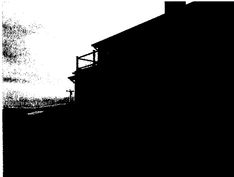
65 Hornblower Drive, Rear, 08/07/15